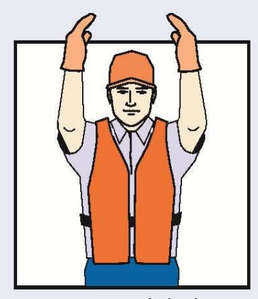
Come straight back.