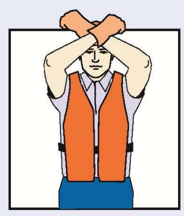
Closed forearms indicate STOP.