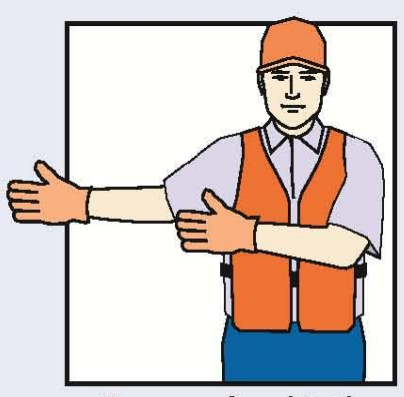
Move rear of coach to the left, as seen in mirror.

The parker giving directions to the driver must possess a very good understanding of the degree of maneuverability of the coach and visualize an imaginary path of the rear wheels that lead to the desired parking spot without hitting anything. Be wary of low-hanging limbs, overhead wires, utility connections, and sharp corners on walkways or patios. Always be in the field of vision afforded by the driver's left side mirror that will permit observation of the rear of the coach. If you need to leave the high visibility left side of the coach, give the STOP signal to the driver.