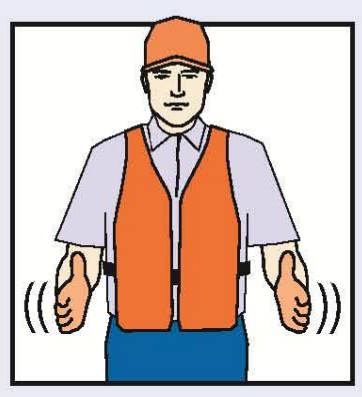
Distance to go (palms apart indicating how far).