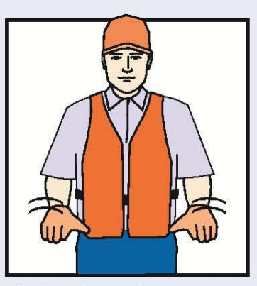
Slowly (when parker is pumping palms down like patting a dog).